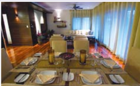
3 Bedroom Apartment 19.5m THB

BOAT LAGOON : Modern 3 bedroom villa with pool on 800 sqm landplot. Located 250 m near the Boat Lagoon in a small residential development. Very good quality and design. Attractive price. 2 minutes to international school.