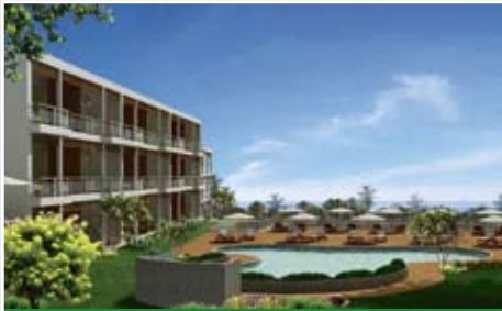
Condominiums 5m THB

KAMALA : Breathtaking location! 20 beachfront villas and 66 condominiums built right at Kamala Beach, all with a fantastic ocean view. Modern, stylish design with use of the best materials only.