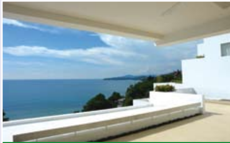
Duplex Penthouse 37m THB

KARON : Luxurious but affordable condominiums at Karon Beach. The project is a 79 unit condominium, developed in 8 buildings of 1, 2 and 3 floors. Most of the units come with a sea view.