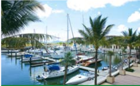
Royal Phuket Marina 22m THB

ROYAL PHUKET MARINA : Luxury 2 bedroom freehold condominium. This apartment is the only available corner unit with direct views over the marina and beautiful sea views. Owner spent 4 m THB on luxury fitout. Large terrace.