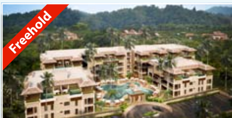
Freehold Condos from 4.9m THB

KAMALA : Long-term residential facilities and amenities and shorter term rental requirements. Private villas and condominiums with sea views and a swimming pool divided by cascading walkthrough waterfalls.