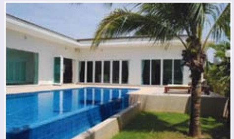
Boat Lagoon Villa 15.8m THB

KALIM : Luxury 4 to 5 bedroom villas overlooking Patong Bay with the amenities of a 5 star resort. Large landplots. Exclusivity, stunning design, prime location, supreme quality. Only 4 villas still available.