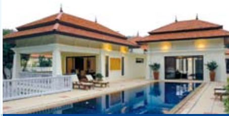
Pool Villa from 32m THB

SURIN : 1-2 bedroom loft style apartments. Ultra modern design open plan living. Within walking distance of restaurants, bars and beaches. 42' flat panel TV's & fully equipped SMEG kitchens. Rental from 37,500 PCM.