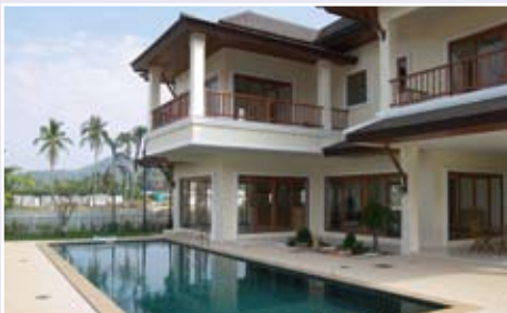
Bangtao Beach 18m THB

KATA : Magnificent 2 bedroom apartment in 5 Star development. 210 sqm. Stunning ocean views overlooking nothing but beaches and palm trees. Big jacuzzi in master suite. Handmade furniture. Private car park. Direct beach access.