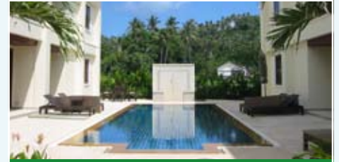
Luxury Apartments from 5.2m THB

THALANG : Beautifully designed 5-bedroom pool villa in a country location next to Khao Phra Thaew National Park. An exceptional home with a large garden over 1 Rai for discerning buyers. Rental from 150,000 PCM.