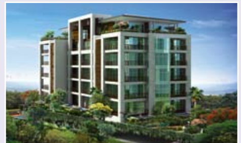
Kata/Karon from 4.9m THB

KATA : Luxury 1 bedroom apartment with breathtaking ocean views in small luxury development with all facilities. Contemporary style, luxury fittings and appliances. Only 100 m to Kata Beach. Fully furnished. 85 sqm living space.