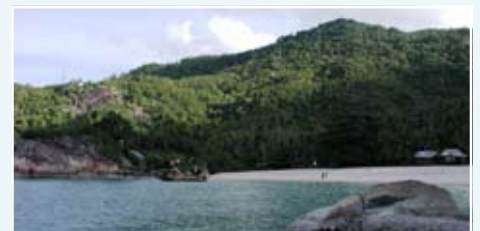
Land for Sale 200m THB

BANGTAO : A selection of freehold condominiums located in Kamala, Surin and Bang Tao Beaches.