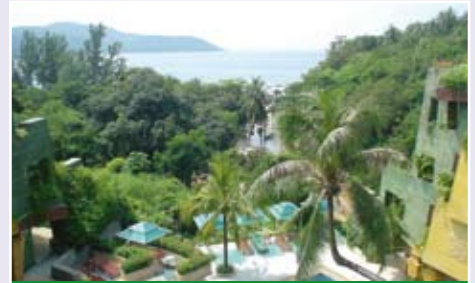
Kata Beach 22m THB

KAMALA : Millionaires Row - Luxury Duplex Penthouse with 3 bedroom + maid's room. Total living space 450 sqm Spacious terrace with unobstructed direct ocean views. Modern style architecture. One of the top 10 views in Phuket.