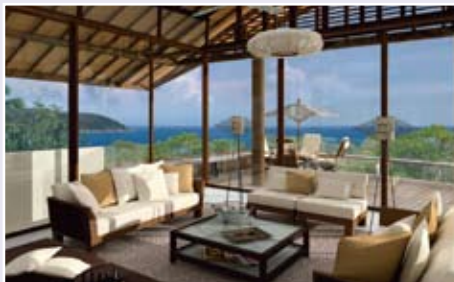
Ocean View Villas 72m THB

BANGTAO : Luxury 3 bedroom villa only 200 m from beach. Large plot, nice garden, 12x4 m swimming pool. High quality construction. State of the art alarm installation. Perfect family home.