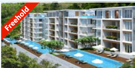
Freehold Condos from 5.5m THB

SURIN : 2 bedroom apartments with modern, light and airy, open plan kitchen/dining/living area design. There is a large swimming pool which extends the full length of the grounds between the units. Rental from 30,000 PCM.