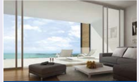
Kamala Beach 11m THB

LAYAN : One bedroom pool villas in Balinese style located close to the famous Laguna. Secure investment with an option of 8% rental guarantee. Bedroom with walk in closet. Bathroom with jacuzzi. Fully furnished.